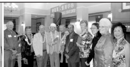
2010 Awards Ceremony