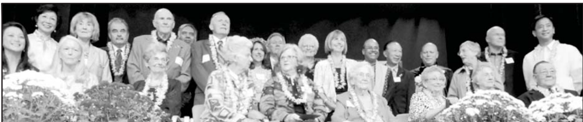
2011 Awards Ceremony