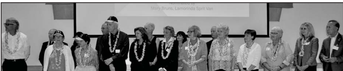
2012 Awards Ceremony

Visit Our Website At: www.culturetoculture.org