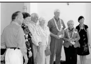
2009 Awards Ceremony